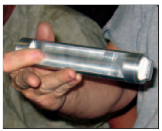
■ FIGURE 4. Rick Abbott's R2-D2 ankle cylinder.

chassis are built with functionality in mind — providing mounting points for add-on devices and making all aspects of the robot visible for demonstration, education, and experimentation. Even larger robots such as those built for robot combat will rarely have purely cosmetic components.