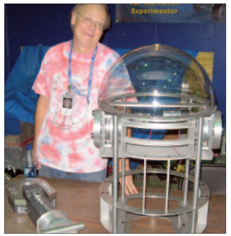
82 NUTS VOLTS May 2008