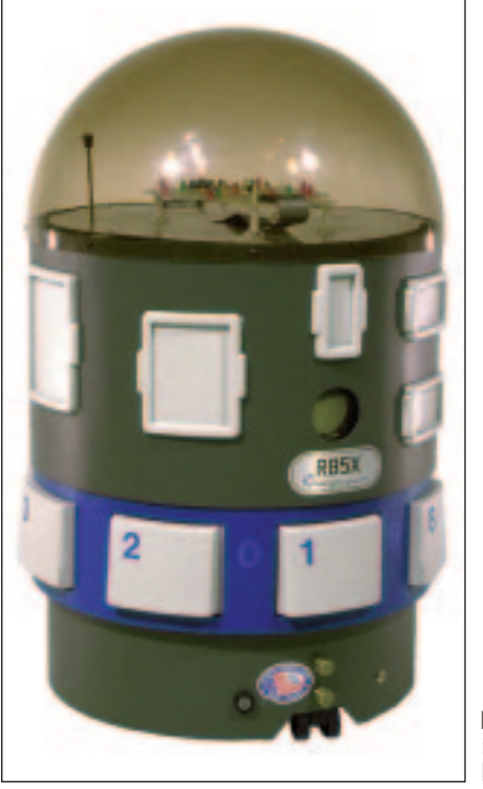
78 NUTS VOLTS May 2008